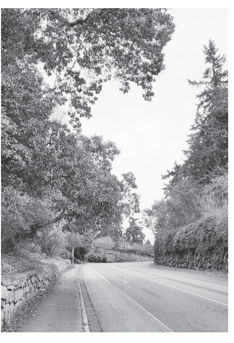
RICHMOND BEACH ROAD LOOKING EAST

Wandering Richmond Beach – Part 1 of a 3-part series