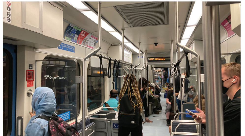
TOP - AT THE U-DISTRICT STATION; BOTTOM - IN THE TUNNEL BETWEEN NORTHGATE AND THE U-DISTRICT..