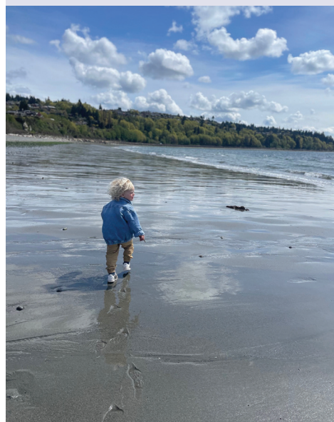
BOY ON BEACH