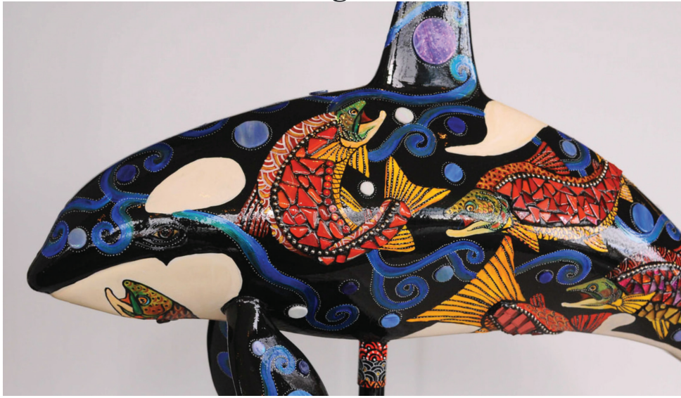
MISSING ORCA, "BELLY FULL OF SALMON" BY MELISSA COLE