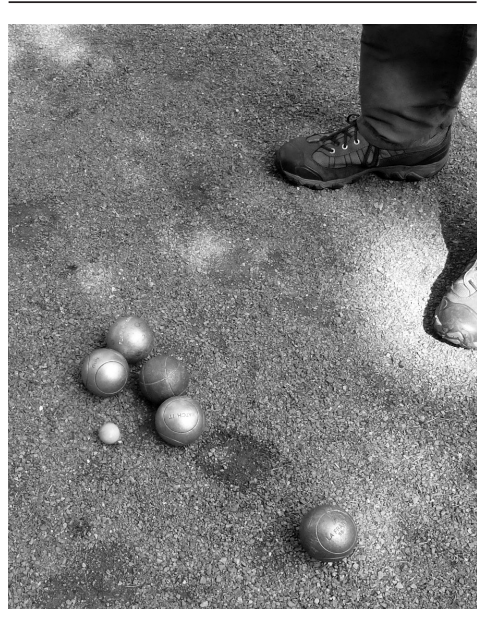
THESE STEEL BALLS (BOULES) ALL LANDED NEAR THE SMALL TARGET BALL (COCHON-NET)