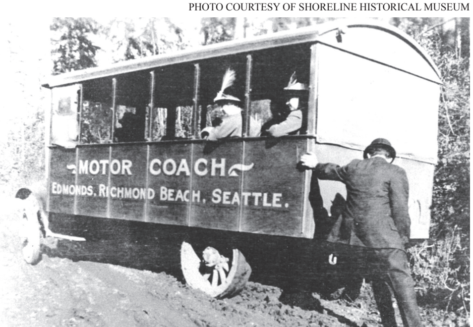
1904. YOST BROTHERS MOTOR COACH VEHICLE IN THE MUD ON RICHMOND BEACH ROAD