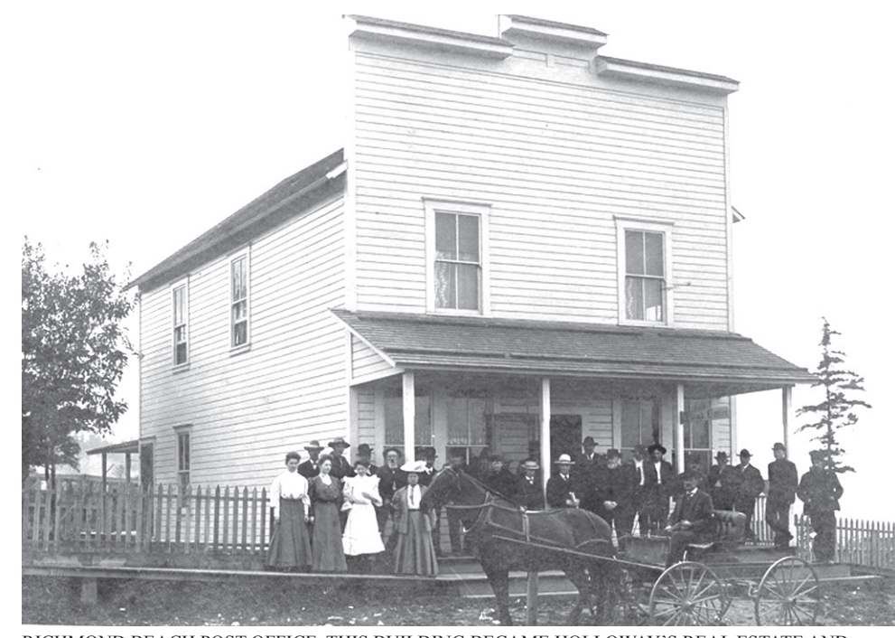
RICHMOND BEACH POST OFFICE. THIS BUILDING BECAME HOLLOWAY'S REAL ESTATE AND INSURANCE OFFICE AND BECAME THE UMBRITE'S DRUGSTORE LATER