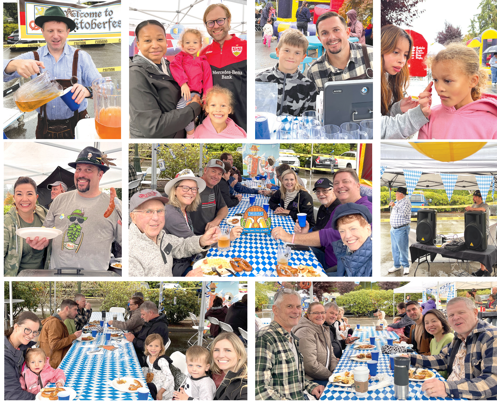
FRIENDS AND FAMILIES GATHERED FOR OKTOBERFEST ON SEPTEMBER 23 AT THE SPIN ALLEY PARKING LOT.