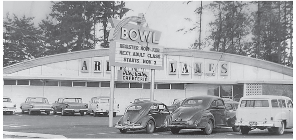
ARDEN LANES OPENED NEARLY 65 YEARS AGO -PHOTO COURTESY OF SPIN ALLEY BOLWING CENTER